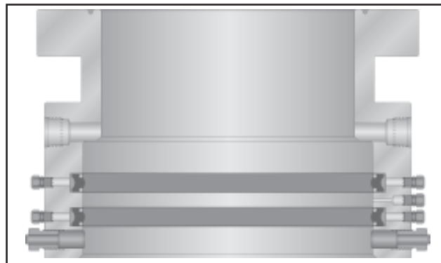
NW-B Diverter Head

The NW-B Diverter Head consists of a full-open bore and friction pin locking mechanism which makes the head easily removable. The low pressure seal is formed by injectable elastomers.